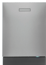
DBI664IXLSSOF Stainless Panel with Integrated Handle and Water Softener