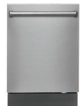
DBI664PHXXLS Stainless Panel with Pro Handle

*Qualifying Asko dishwasher(s) must be purchased between January 1, 2020- June 30, 2020 to be eligible to receive $150 rebate on a Prepaid card. All claims must include a copy of the original sales receipt or invoice, serial number(s), and model number(s) and be submitted to subzerowolfpromotions.com by August 31, 2020 to complete the claim. No late submissions will be accepted. Rebate is valid on purchases at all Sub-Zero, Wolf, Cove and ASKO authorized retailers in Southern California counties: Kern, Los Angeles, Orange, Riverside, San Bernardino, San Diego, San Luis Obispo, Santa Barbara, and Ventura. Purchases in other areas or at non-authorized retailers do not qualify. Sub-Zero Group West is not responsible for lost, late or illegible entries. All claims are subject to audit. Please allow 3-4 weeks to receive your Prepaid card once your claim has been approved. Builder and wholesale purchases do not qualify. Can be combined with other offers. Cards are non-transferable and cannot be redeemed for the cash value. Please retain a copy of your submission and invoice for your records. Reward paid via Prepaid card in US dollars. The card is issued by the Bancorp Bank, Member FDIC, pursuant to a license from Visa U.S.A. Inc. Please pay attention to the expiration of your card and the card's terms and conditions.