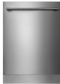
DBI663THS Stainless Panel with Tubular Handle