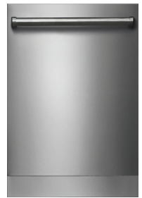
DBI663PHS Stainless Panel with Pro Handle