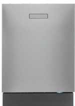
DBI664IXXLS Stainless Panel with Integrated Handle