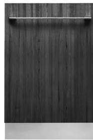
DFI663XXL Panel-Ready with XXL Interior