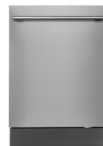
DBI664THXXLS Stainless Panel with Tubular Handle