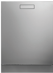
DBI663IS Stainless Panel with Integrated Handle