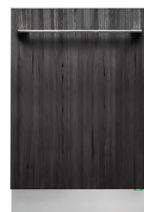
DFI664XXLSOF Panel-Ready with Water Softener